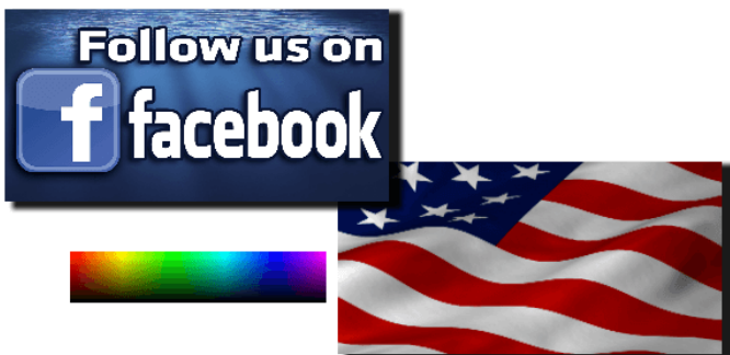
Example of colors only. Amount of detail is dependent on matrix size.

This full-color display is capable of showing an enormous number of colors by combining red, green and blue light in different amounts!