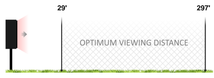
The display area is approximately 3'-1.75" high by 9'-5.25" wide, or 29.7 sq.ft. per side.

The optimum viewing distance for this display is between 29' and 297' . Images and video clips at closer than 29' will be discernible, but will appear pixelated. Greater than 297' will decrease the display's readability. Learn more.