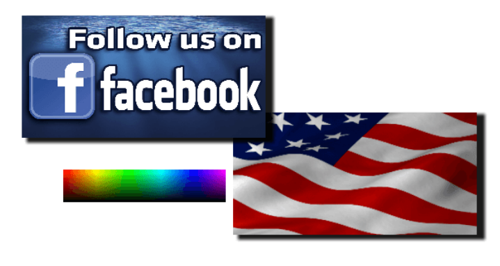
Example of colors only. Amount of detail is dependent on matrix size.

This full-color display is capable of showing an enormous number of colors by combining red, green and blue light in different amounts!