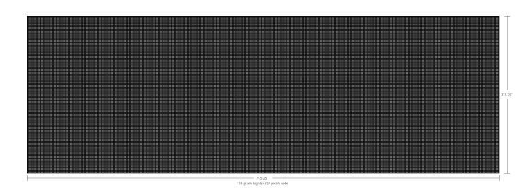
View larger image

108x324 is the matrix size. This is the number of pixels high (108) and the number of pixels wide (324) of the display. That's 34,992 pixels per side! The more pixels, the higher the clarity and amount of detail that can be shown.